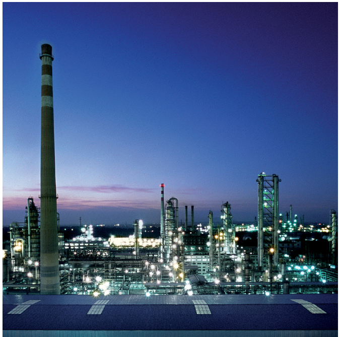
Predestined for emergency shutdown applications: Klippon® Control Stations score when it comes to the safe shutdown of plant sections, such as in the process industry

Order your distributor enclosure as well as control and signaling units from a single source and from one enclosure design – for reliable security and reduced storage costs for maintenance and repair operations.